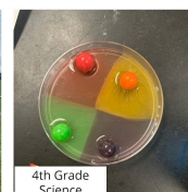
4th Grade Science