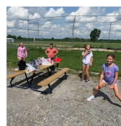
Week of Sept. 7th