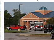
Exciting first day back!